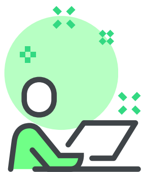
The domain Owner