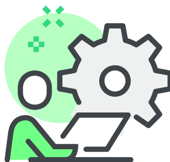
The current Admin Contact